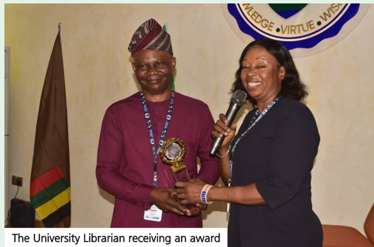
The University Librarian receiving an award