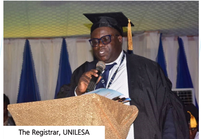
The Registrar, UNILESA

The Vice-Chancellor also reminded them to adhere to the University's dress code, warning that improper dressing would attract sanctions. He also instructed all students to wear their identity cards at all times for easy identification within the campus.