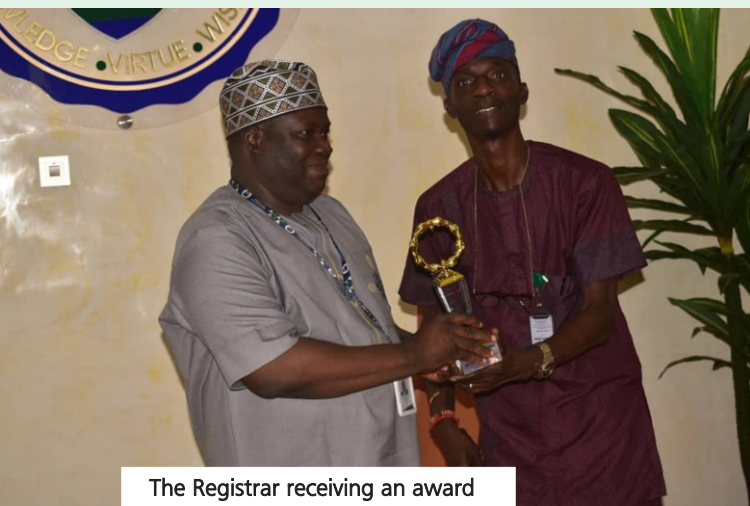
The Registrar receiving an award