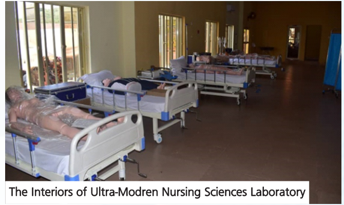
The Interiors of Ultra-Modren Nursing Sciences Laboratory