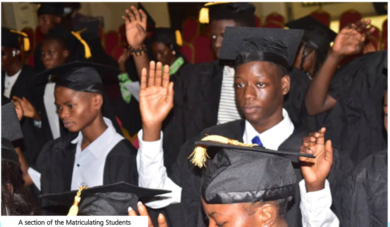
A section of the Matriculating Students