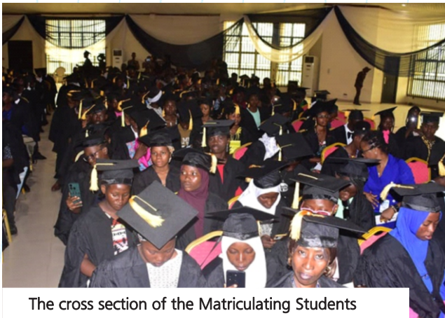
The cross section of the Matriculating Students

The Vice-Chancellor assured students of the University's commitment to providing adequate facilities, including libraries, laboratories, and sporting equipment, to ensure a conducive learning environment.