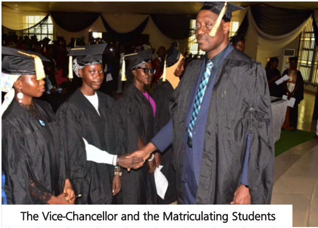
The Vice-Chancellor and the Matriculating Students