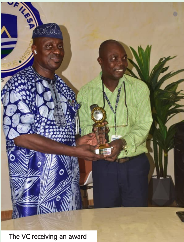
The VC receiving an award

Further donation of mattresses towards the development of the students' hostel was made by the Staff to the University at the event. It would be recalled that Staff of the University had earlier donated 150 mattresses to the University