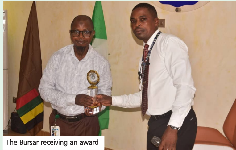
The Bursar receiving an award

The Vice-Chancellor expressed gratitude for the recognition and emphasized the importance of sustaining the existing peaceful atmosphere. He also