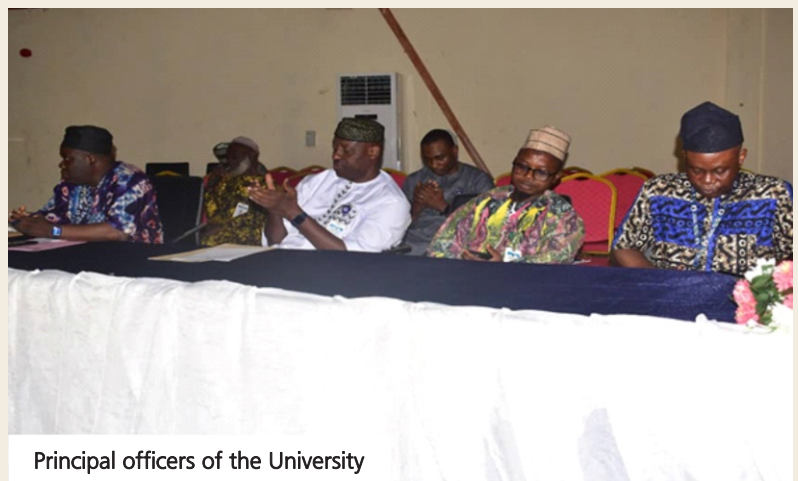
Principal officers of the University

Infrastructure development was also emphasized, particularly the construction of internal road networks, made possible through the support of Governor Ademola Jackson Nurudeen Adeleke. Moreover, temporary staff inherited from the former Osun State College of Education, Ilesa, were granted permanent appointments, and all outstanding peculiar and hazard allowances were fully settled.