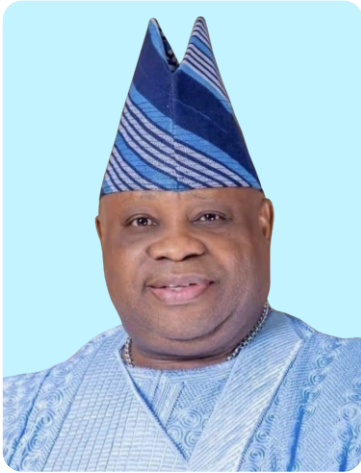
His Excellency, Sen. Ademola Jackson Nurudeen Adeleke Governor of Osun State

The Governor's various interventions have had a profound impact on the University, with significant improvement evident in various areas such as the development of infrastructural facilities, construction of internal roads, enhancement of teaching and learning resources and equipment and improvement of staff and student welfare.