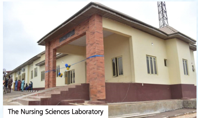
The Nursing Sciences Laboratory