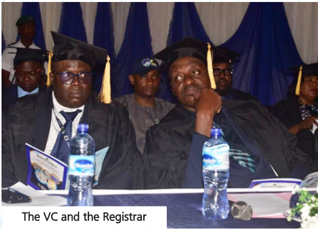
The VC and the Registrar