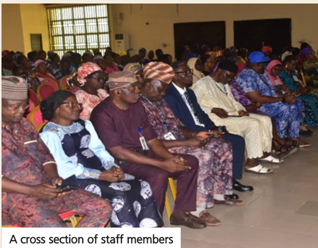
A cross section of staff members